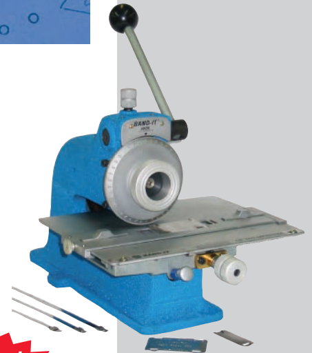
ID Tag Imprinter Tool