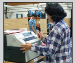
Custom Embossing Factory Service