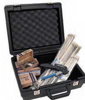
ID Kit ID3009